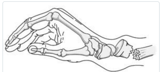
A Colles fracture occurs when the broken end of the radius tilts upward.

One of the most common distal radius fractures is a Colles fracture, in which the broken fragment of the radius tilts upward. This fracture was first described in 1814 by an Irish surgeon and anatomist, Abraham Colles -- hence the name "Colles" fracture.