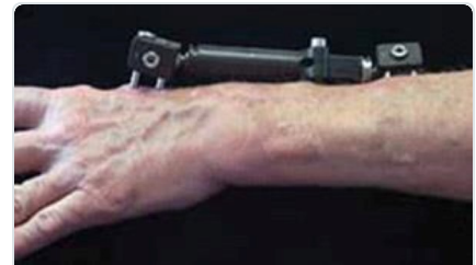
An external fixator

Open fractures. Surgery is required as soon as possible (within 8 hours after injury) in all open fractures. The exposed soft tissue and bone must be thoroughly cleaned (debrided) and antibiotics may be given to prevent infection. Either external or internal fixation methods will be used to hold the bones in place. If the soft tissues around the fracture are badly damaged, your doctor may apply a temporary external fixator. Internal fixation with plates or screws may be utilized at a second procedure several days later.