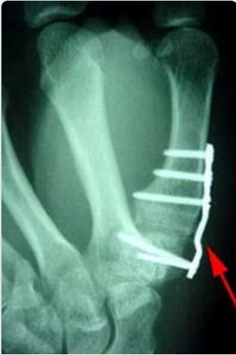
A joint fusion using a plate and screws at the base of the thumb.

When the damage has progressed to a point that the surfaces will no longer work, a joint replacement or a fusion (arthrodesis) is performed.