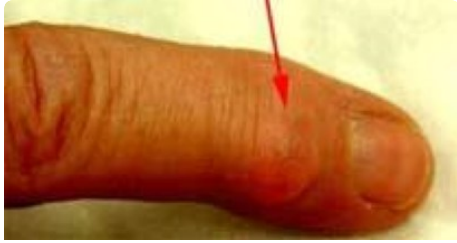
Mucous cyst of the index finger.

When arthritis affects the end joints of the fingers (DIP joints), small cysts (mucous cysts) may develop. The cysts may then cause ridging or dents in the nail plate of the affected finger.