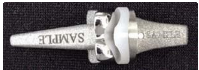
An example of a finger joint prosthesis used in joint replacement surgery.

As with any evolving technology, the long-term results of the hand or wrist joint replacements are not yet known. Early results have been promising. Talk with your doctor to find out if these implants are right for you.