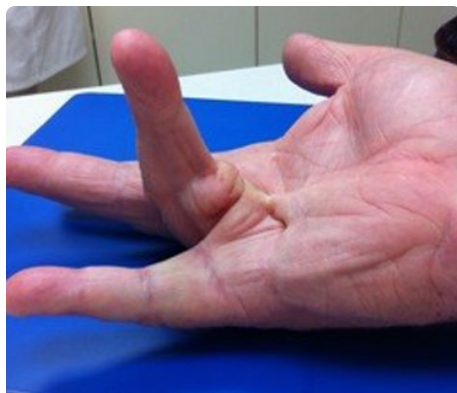
A Dupuytren's contracture. The patient cannot fully extend his ring finger because of the tethering effect of the cord-like structure in his palm.

Often, Dupuytren's is first detected when lumps of tissue, or nodules, form under the skin in the palm. This may be followed by pitting on the surface of the palm as the diseased tissue pulls on the overlying skin.