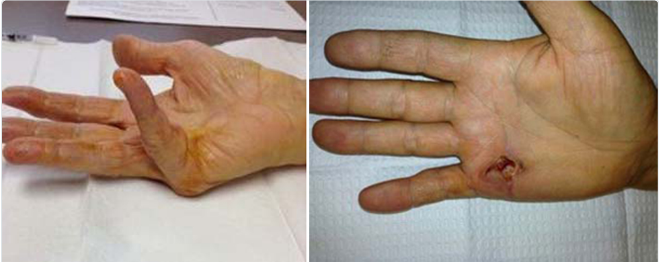
(Left) Clinical photo shows the contracture of a patient's little finger before fasciotomy. (Right) After the procedure, the patient is able to straighten his finger. The wound is left open to heal.

Subtotal palmar fasciectomy. In this procedure, your doctor will make an incision, then remove as much of the abnormal tissue and cord(s) as possible in order to straighten your finger(s). Several types of incisions can be used in a fasciectomy but, often, a "zig-zag" incision is made along the natural creases in the hand.